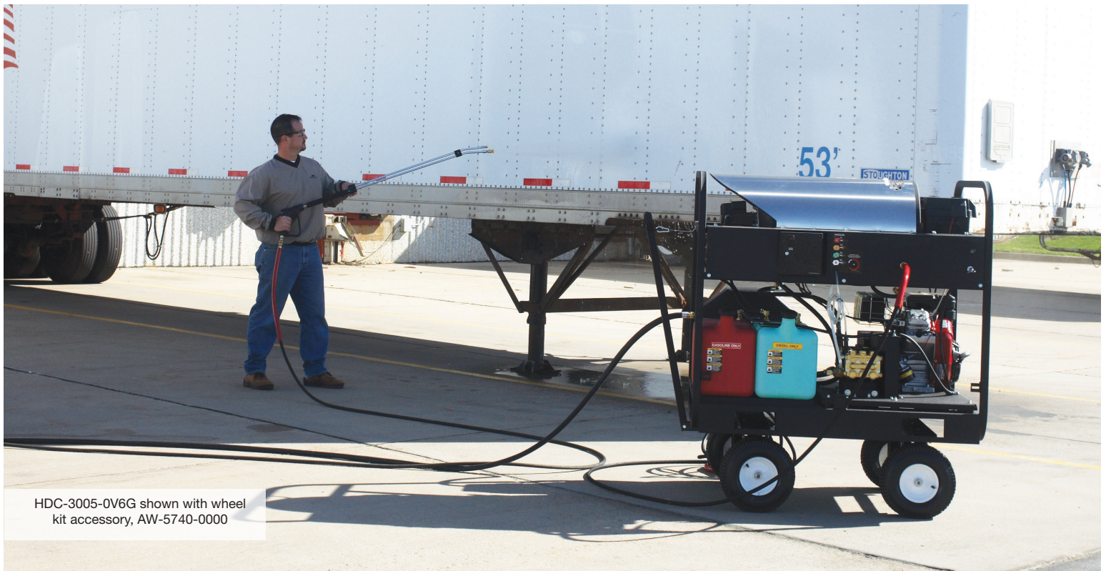
HDC-3005-0V6G shown with wheel kit accessory, AW-5740-0000

Note: Options HX-0130 and HX-0282 cannot be ordered together, each option must be ordered separately.