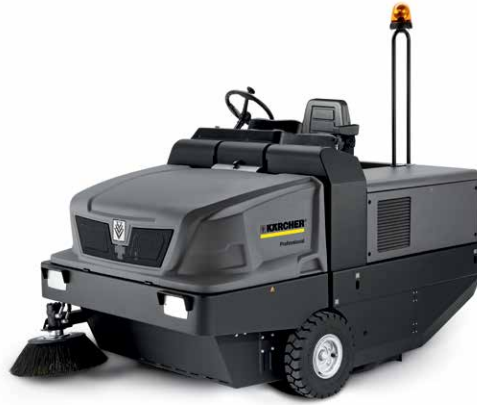
KM 150/500 R BP / KM 150/500 R BP 2SB