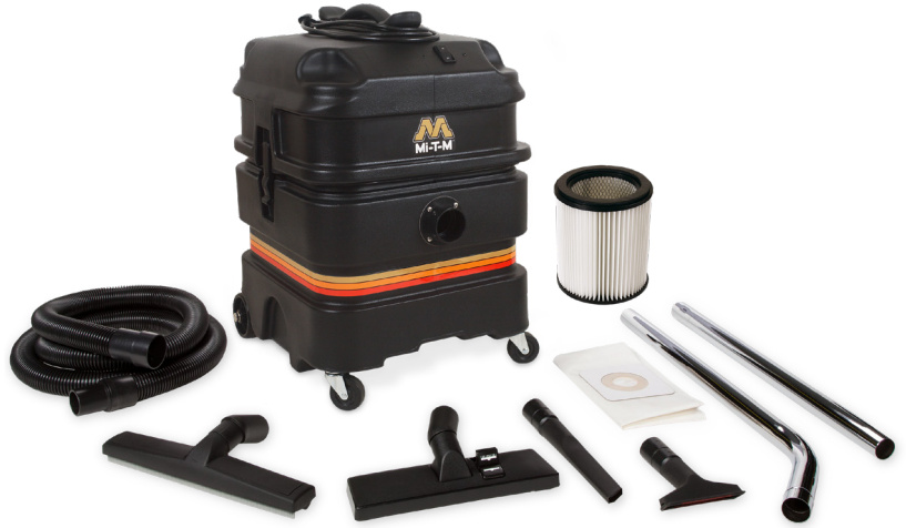
MV-1300-0MEV Shown with standard accessories

These powerful wet/dry vacuums feature a hydro flow filter and are some of the quietest vacuums on the market.